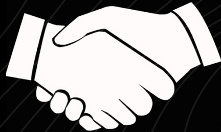
Teams, Partners, Sponsors